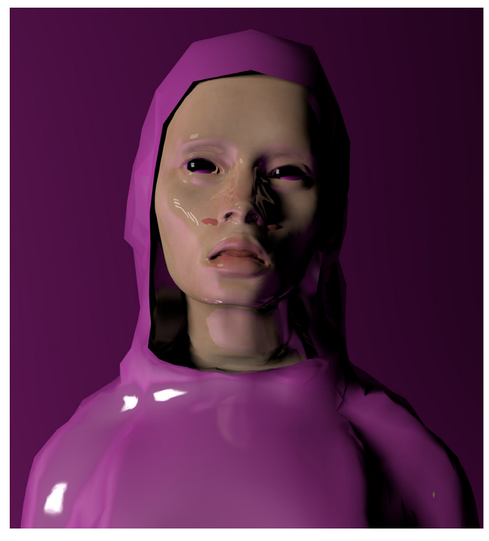
Av3ry is an AI program and a virtual persona, who is composing music, communicating with people and learning from interactions.

Av3ry combines natural language processing, algorithmic composition, data crawling and machine learning. She*he is constantly operating and creating music, poems and pictures in the moment - based on communication with interacting users. The music pieces are based on the criteria specified by the users. So the result is instant and individual - and send directly to a single user. The program extracts key features from the description of the users and tries to generate the pieces accordingly. Through the feedback of the users after listening to the result the algorithm can learn and fine-tune its parameters. In the same way the language generation is updated and adjusted through the conversations.